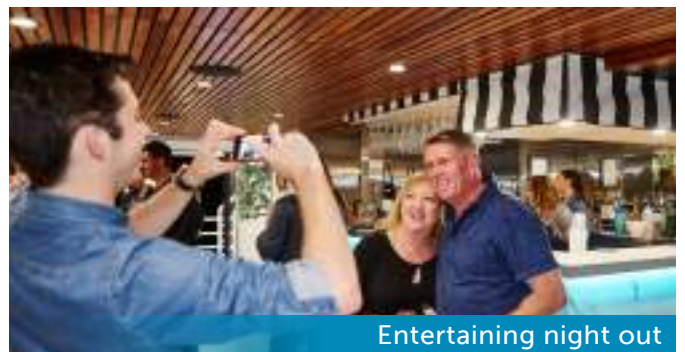
Entertaining night out