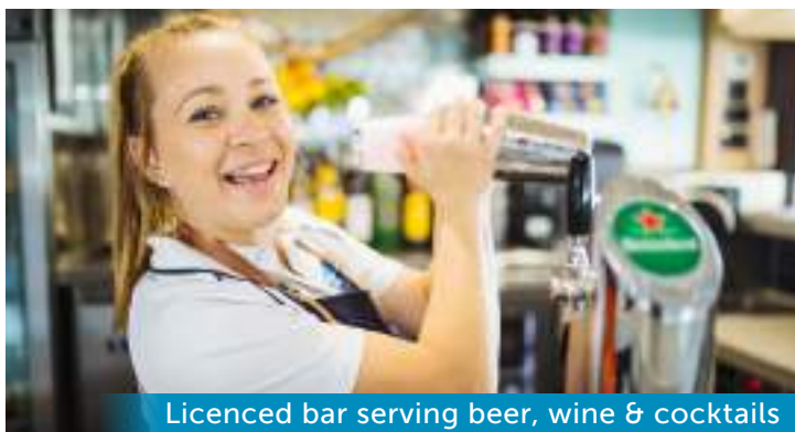
Licensed bar serving beer, wine & cocktails