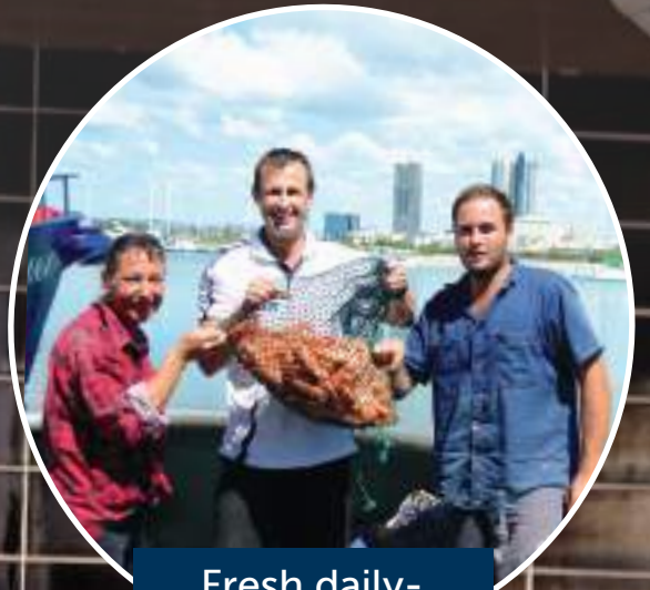
Fresh daily-caught prawns