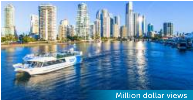
Million dollar views