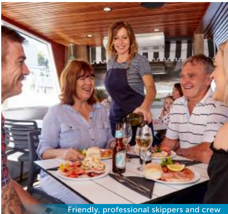
Friendly, professional skippers and crew