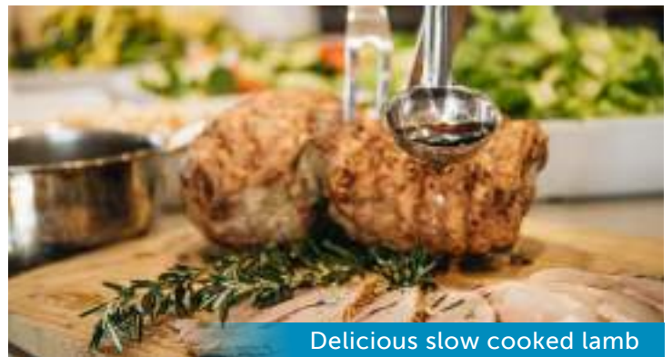
Delicious slow cooked lamb